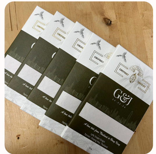
50g partly customised bars