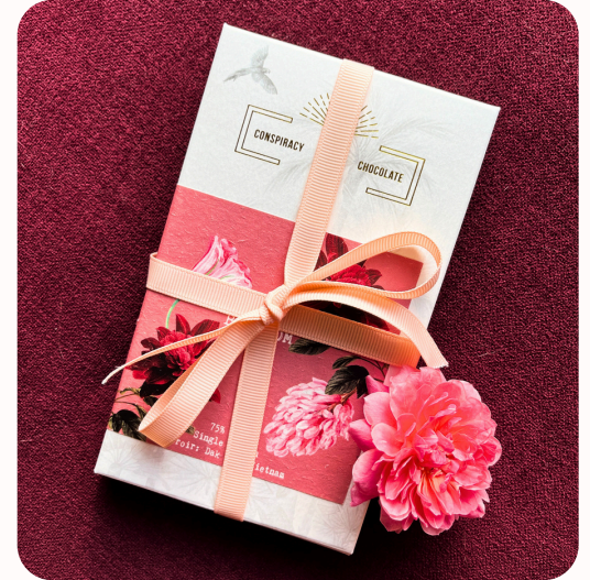
50g partly customised bars