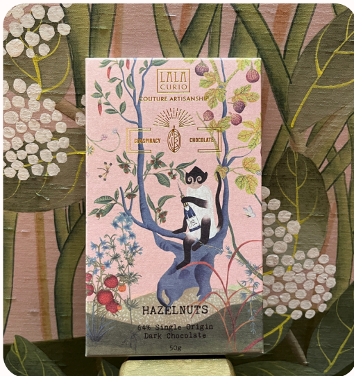
50g fully customised