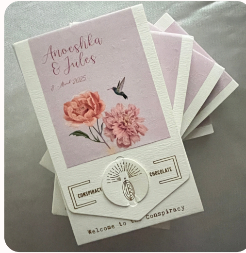
30g partly customised bar