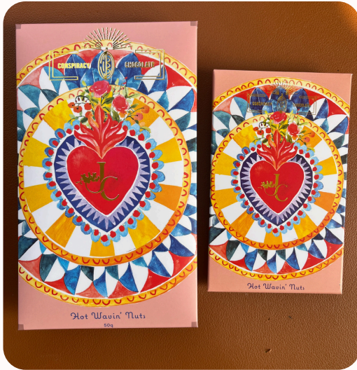
50g and 30g bars fully customised