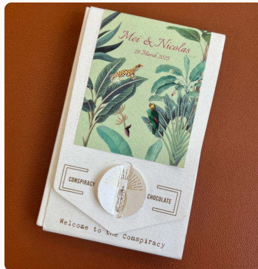
30g partly customised bar